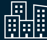
Height & Density