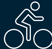
Bike & Vehicle Parking