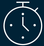
Length of Process