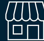
Impacts on Existing Retail