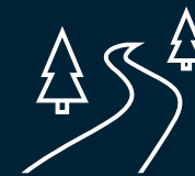
Mews from W 9 th Ave to W 10 th Ave